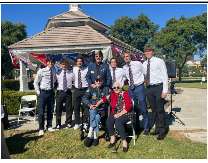
Lions Heart Boys at Ladera Ranch Middle School presented a Veterans Day Event on November 11th.