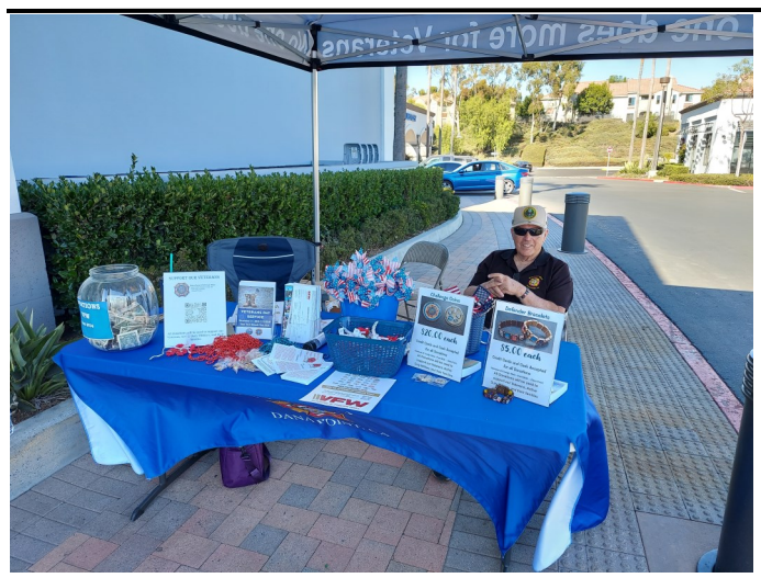
On November 9th & 10th, Comrades distributed Buddy Poppies at two locations: Albertsons in Laguna Niguel and Pavilions in San Clemente.